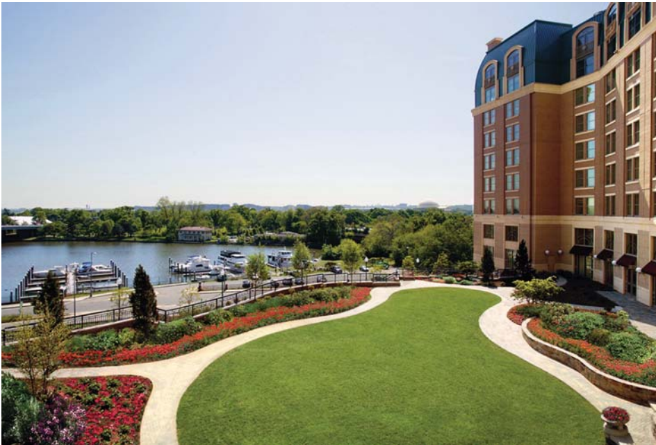
View of completed rooftop gardens and lawn

Client: The Portals Hotel Site, LLC, Mandarin Oriental Management, Inc.