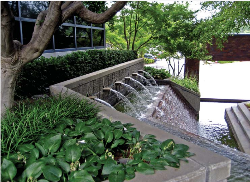
View of planter and waterfeature

Client / Developer: Lee Summis & Associates