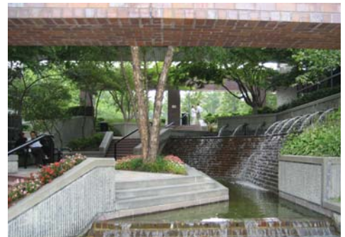
View of courtyard and water features