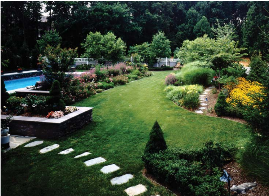
View of informal lawn and perennial gardens